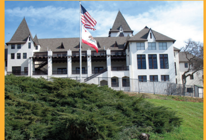
Lakeside Campus Lucerne – Lake County