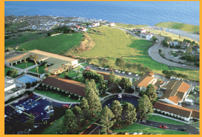
Oceanview Campus Palos Verdes – Los Angeles County

The University offers a distinctive range of experiences along the Los Angeles County coastline in Palos Verdes, in downtown San Pedro and in rural Northern California.