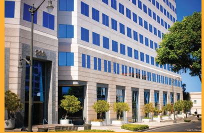
Waterfront Campus San Pedro – Los Angeles County