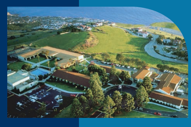
Oceanview Campus, Palos Verdes Los Angeles County